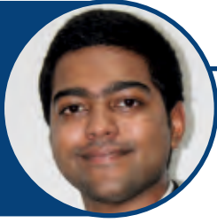
PUSHYAMITHRA SRI SAI BALAJI B